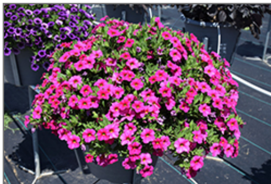
Callie Rose Calibrachoa in bloom