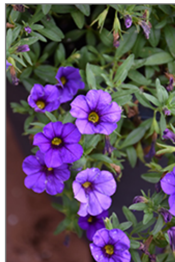
Aloha Kona Midnight Blue Calibrachoa flowers

Aloha Kona Midnight Blue Calibrachoa is recommended for the following landscape applications;