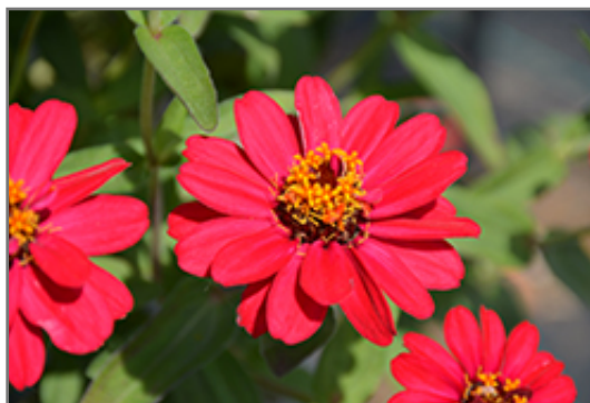
Profusion Double Hot Cherry Zinnia flowers