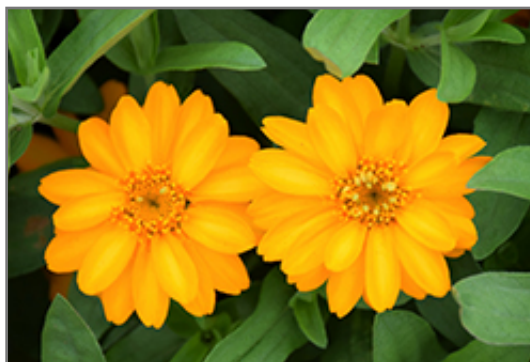
Profusion Double Golden Zinnia flowers