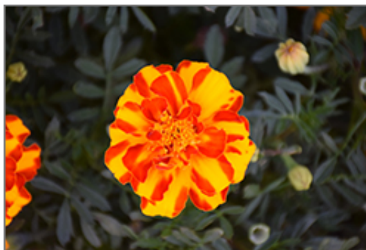
Durango Bolero Marigold flowers