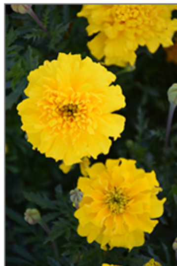
Cresta Yellow Marigold flowers