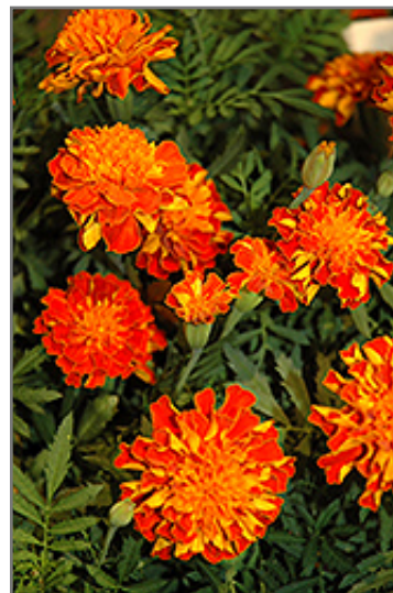
Cresta Flame Marigold flowers