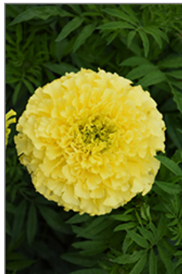
Lady Primrose Marigold flowers