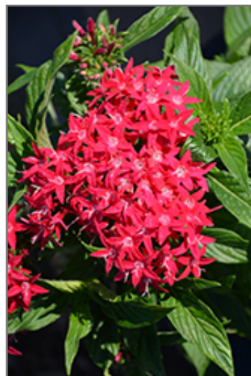
Graffiti OG Lipstick Star Flower flowers

Graffiti OG Lipstick Star Flower is recommended for the following landscape applications;