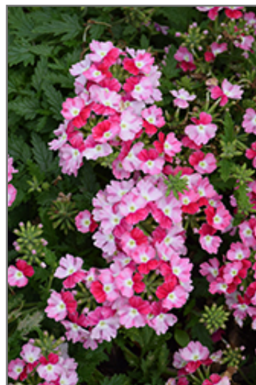
Lanai Twister Red Verbena flowers

Lanai Twister Red Verbena is recommended for the following landscape applications;