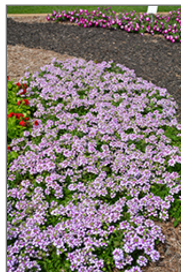
Lanai Twister Purple Verbena in bloom