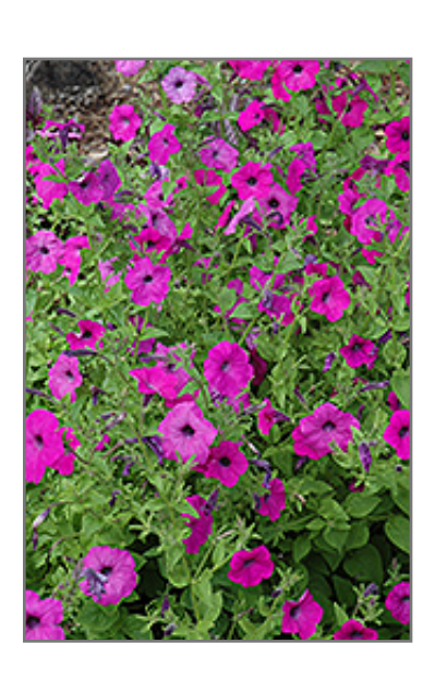
Laura Bush Petunia flowers

Laura Bush Petunia will grow to be about 18 inches tall at maturity, with a spread of 30 inches. When grown in masses or used as a bedding plant, individual plants should be spaced approximately 24 inches apart. Its foliage tends to remain dense right to the ground, not requiring facer plants in front. This fast-growing annual will normally live for one full growing season, needing replacement the following year.