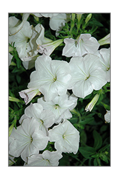
Good And Plenty White Petunia flowers

Good And Plenty White Petunia will grow to be about 10 inches tall at maturity, with a spread of 14 inches. When grown in masses or used as a bedding plant, individual plants should be spaced approximately 10 inches apart. Its foliage tends to remain low and dense right to the ground. This fast-growing annual will normally live for one full growing season, needing replacement the following year.