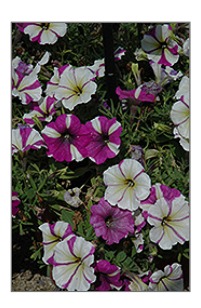
Blue A Fuse Petunia flowers

Blue A Fuse Petunia will grow to be about 8 inches tall at maturity, with a spread of 12 inches. When grown in masses or used as a bedding plant, individual plants should be spaced approximately 10 inches apart. Its foliage tends to remain low and dense right to the ground. This fast-growing annual will normally live for one full growing season, needing replacement the following year.