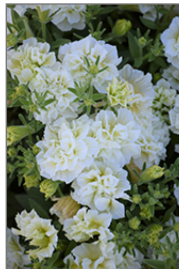
Blanket Double Chardonnay Petunia flowers

Blanket Double Chardonnay Petunia is recommended for the following landscape applications;