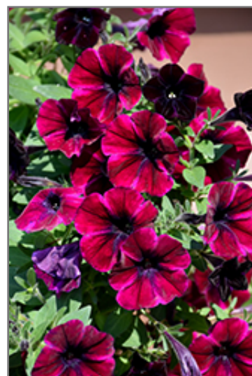
Sweetunia Johnny Flame Petunia flowers