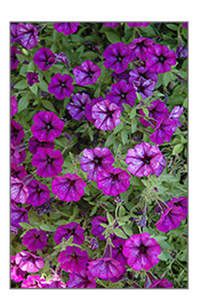
Littletunia Ultra Purple Petunia flowers

Littletunia Ultra Purple Petunia will grow to be about 12 inches tall at maturity, with a spread of 12 inches. When grown in masses or used as a bedding plant, individual plants should be spaced approximately 10 inches apart. Its foliage tends to remain dense right to the ground, not requiring facer plants in front. This fast-growing annual will normally live for one full growing season, needing replacement the following year.