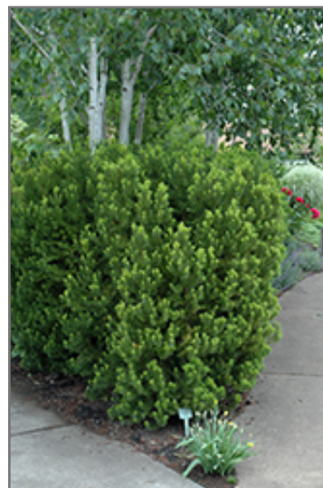
Hicks Yew