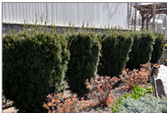
Hicks Yew

This shrub performs well in both full sun and full shade. However, you may want to keep it away from hot, dry locations that receive direct afternoon sun or which get reflected sunlight, such as against the south side of a white wall. It does best in average to evenly moist conditions, but will not tolerate standing water. It is not particular as to soil type or pH. It is highly tolerant of urban pollution and will even thrive in inner city environments, and will benefit from being planted in a relatively sheltered location. Consider applying a thick mulch around the root zone in winter to protect it in exposed locations or colder microclimates. This particular variety is an interspecific hybrid, and parts of it are known to be toxic to humans and animals, so care should be exercised in planting it around children and pets.