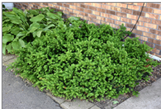
Emerald Spreader Yew

This shrub performs well in both full sun and full shade. However, you may want to keep it away from hot, dry locations that receive direct afternoon sun or which get reflected sunlight, such as against the south side of a white wall. It does best in average to evenly moist conditions, but will not tolerate standing water. It is not particular as to soil type or pH. It is highly tolerant of urban pollution and will even thrive in inner city environments, and will benefit from being planted in a relatively sheltered location. Consider applying a thick mulch around the root zone in winter to protect it in exposed locations or colder microclimates. This is a selected variety of a species not originally from North America, and parts of it are known to be toxic to humans and animals, so care should be exercised in planting it around children and pets.