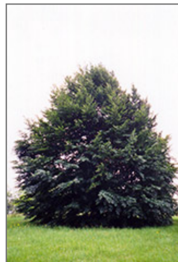
European Beech