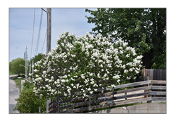
White French Lilac in bloom