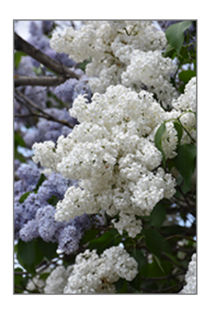
White French Lilac flowers

This is a high maintenance shrub that will require regular care and upkeep, and should only be pruned after flowering to avoid removing any of the current season's flowers. It is a good choice for attracting butterflies to your yard, but is not particularly attractive to deer who tend to leave it alone in favor of tastier treats. Gardeners should be aware of the following characteristic(s) that may warrant special consideration;