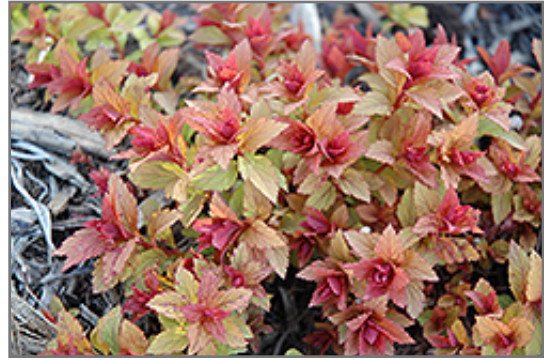
Magic Carpet Spirea foliage

Magic Carpet Spirea will grow to be about 24 inches tall at maturity, with a spread of 3 feet. It tends to fill out right to the ground and therefore doesn't necessarily require facer plants in front. It grows at a fast rate, and under ideal conditions can be expected to live for approximately 20 years.