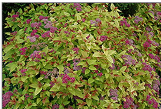
Magic Carpet Spirea flowers