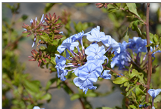
Imperial Blue Plumbago flowers

Imperial Blue Plumbago is recommended for the following landscape applications;