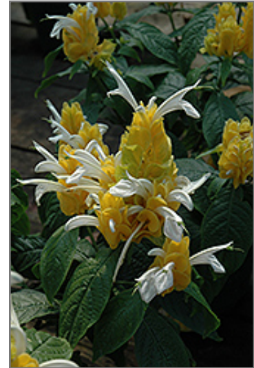
Golden Shrimp Plant flowers