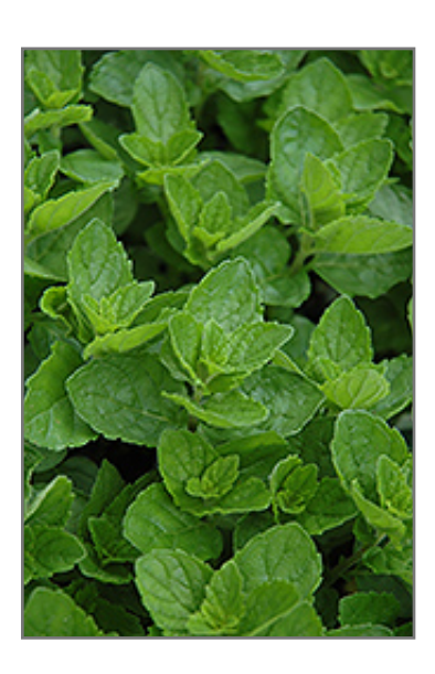
Spearmint foliage