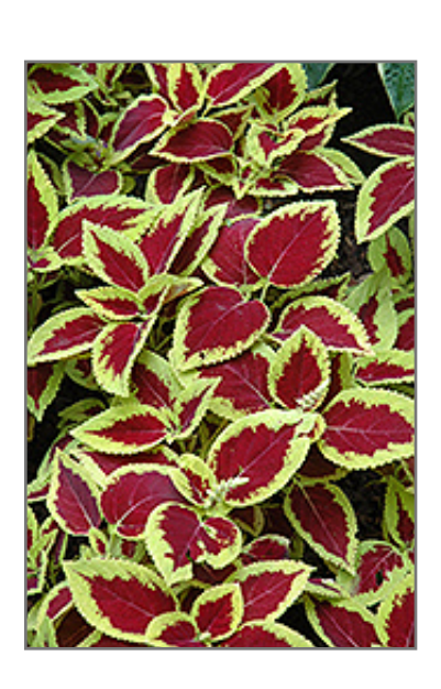
Fireball Coleus foliage

Fireball Coleus will grow to be about 18 inches tall at maturity, with a spread of 12 inches. When grown in masses or used as a bedding plant, individual plants should be spaced approximately 10 inches apart. Although it's not a true annual, this fast-growing plant can be expected to behave as an annual in our climate if left outdoors over the winter, usually needing replacement the following year. As such, gardeners should take into consideration that it will perform differently than it would in its native habitat.