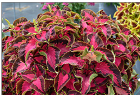
Chocolate Covered Cherry Coleus foliage