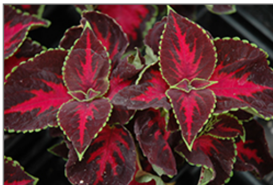
Chocolate Covered Cherry Coleus foliage