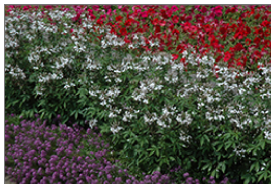
Senorita Blanca Spiderflower in bloom