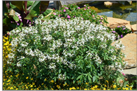
Senorita Blanca Spiderflower in bloom

Senorita Blanca Spiderflower is a fine choice for the garden, but it is also a good selection for planting in outdoor containers and hanging baskets. With its upright habit of growth, it is best suited for use as a 'thriller' in the 'spiller-thriller-filler' container combination; plant it near the center of the pot, surrounded by smaller plants and those that spill over the edges. It is even sizeable enough that it can be grown alone in a suitable container. Note that when growing plants in outdoor containers and baskets, they may require more frequent waterings than they would in the yard or garden.