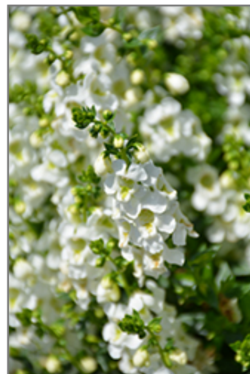
Serenita White Angelonia flowers

Serenita White Angelonia is an herbaceous annual with an upright spreading habit of growth. Its relatively fine texture sets it apart from other garden plants with less refined foliage.