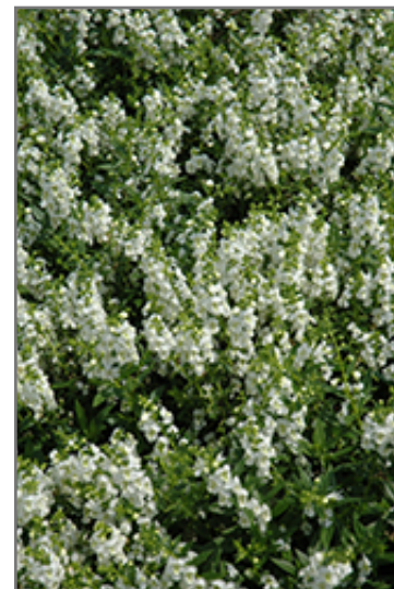
Serenita White Angelonia flowers