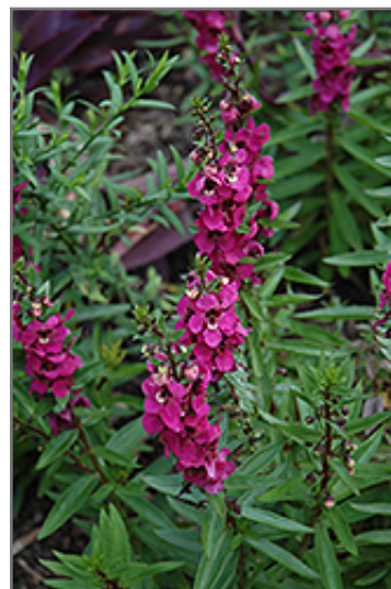
Serenita Raspberry Angelonia flowers

Serenita Raspberry Angelonia is recommended for the following landscape applications;