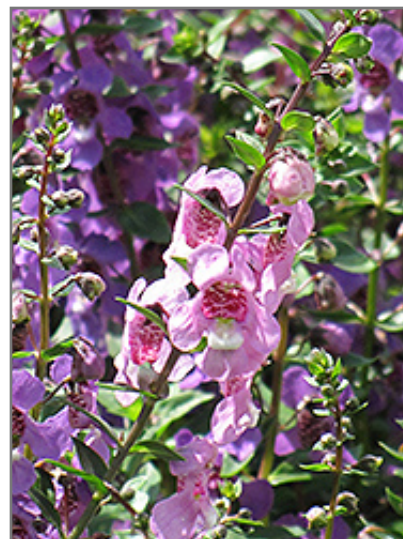
Serena Lavender Pink Angelonia flowers