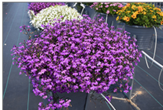
Techno Violet Lobelia in bloom