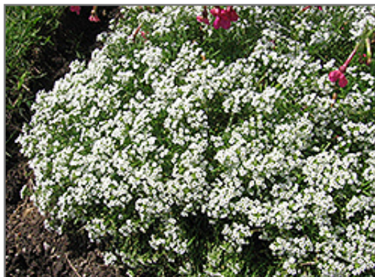
Wonderland White Alyssum in bloom