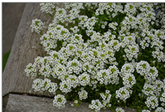
Snow Princess Alyssum flowers

Snow Princess Alyssum is recommended for the following landscape applications;