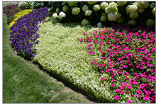
Frosty Knight Alyssum in bloom

Frosty Knight Alyssum will grow to be only 6 inches tall at maturity, with a spread of 18 inches. When grown in masses or used as a bedding plant, individual plants should be spaced approximately 15 inches apart. Its foliage tends to remain low and dense right to the ground. This fast-growing annual will normally live for one full growing season, needing replacement the following year.