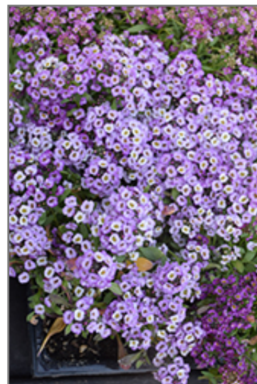
Clear Crystal Lavender Shades Sweet Alyssum flowers

Clear Crystal Lavender Shades Sweet Alyssum is recommended for the following landscape applications;