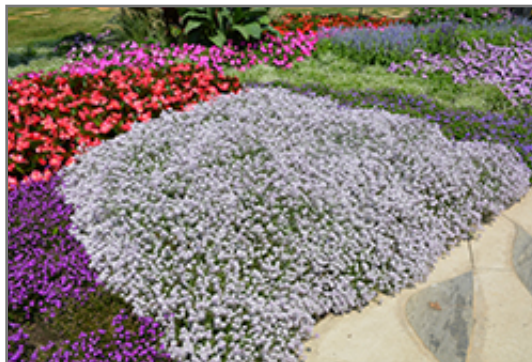
Blushing Princess Sweet Alyssum in bloom

Blushing Princess Sweet Alyssum is a fine choice for the garden, but it is also a good selection for planting in hanging baskets. Because of its trailing habit of growth, it is ideally suited for use as a 'spiller' in the 'spiller-thriller-filler' container combination; plant it near the edges where it can spill gracefully over the pot. Note that when growing plants in outdoor containers and baskets, they may require more frequent waterings than they would in the yard or garden.