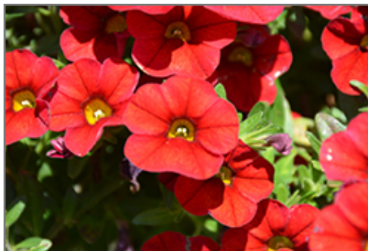
Superbells Red Calibrachoa flowers