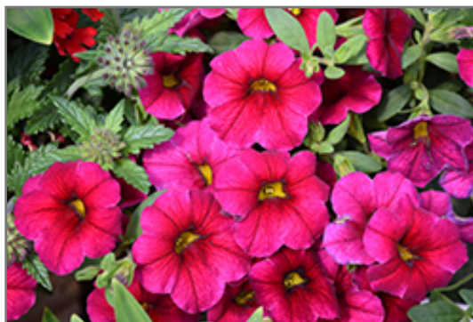
Superbells Cherry Red Calibrachoa flowers