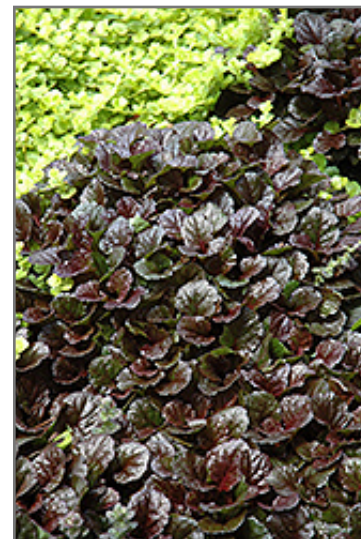
Black Scallop Bugleweed