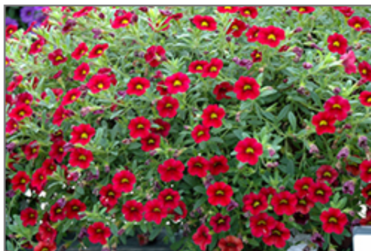
MiniFamous Compact Dark Red Calibrachoa flowers

MiniFamous Compact Dark Red Calibrachoa is recommended for the following landscape applications;