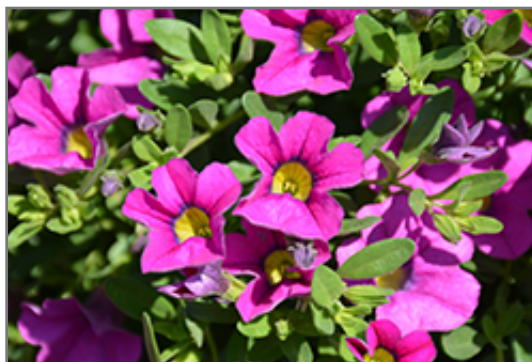
Million Bells Trailing Pink Calibrachoa flowers

Million Bells Trailing Pink Calibrachoa is recommended for the following landscape applications;