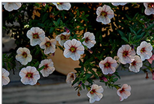
Celebration Mozart Calibrachoa flowers