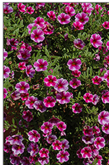
Can-Can Hot Pink Star Calibrachoa flowers

Can-Can Hot Pink Star Calibrachoa is recommended for the following landscape applications;