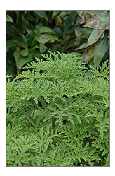
Strawberry Scented Geranium foliage