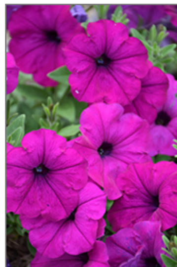
Easy Wave Violet Petunia flowers