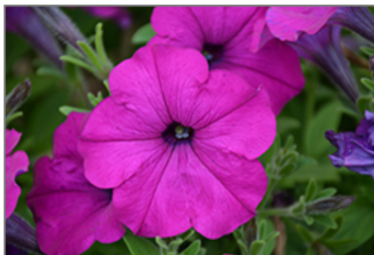
Easy Wave Violet Petunia flowers

This plant will require occasional maintenance and upkeep. Trim off the flower heads after they fade and die to encourage more blooms late into the season. It is a good choice for attracting bees and hummingbirds to your yard, but is not particularly attractive to deer who tend to leave it alone in favor of tastier treats. It has no significant negative characteristics.