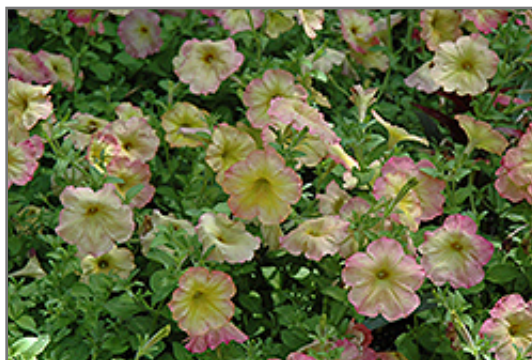
Debonair Dusty Rose Petunia flowers