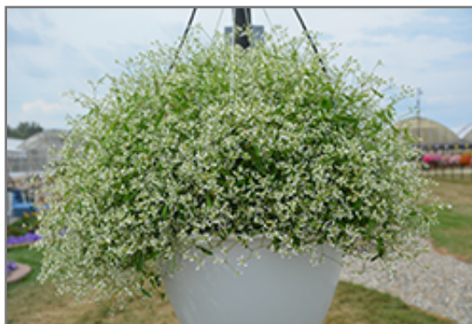
Diamond Frost Euphorbia in bloom

Diamond Frost Euphorbia is a fine choice for the garden, but it is also a good selection for planting in outdoor containers and hanging baskets. It is often used as a 'filler' in the 'spiller-thriller-filler' container combination, providing a mass of flowers against which the thriller plants stand out. Note that when growing plants in outdoor containers and baskets, they may require more frequent waterings than they would in the yard or garden.