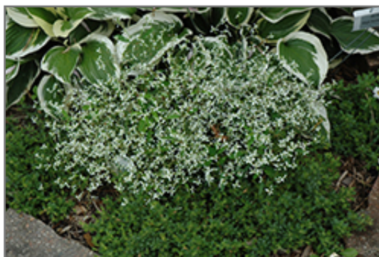
Diamond Frost Euphorbia in bloom