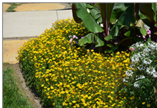
Goldilocks Rocks Bidens in bloom