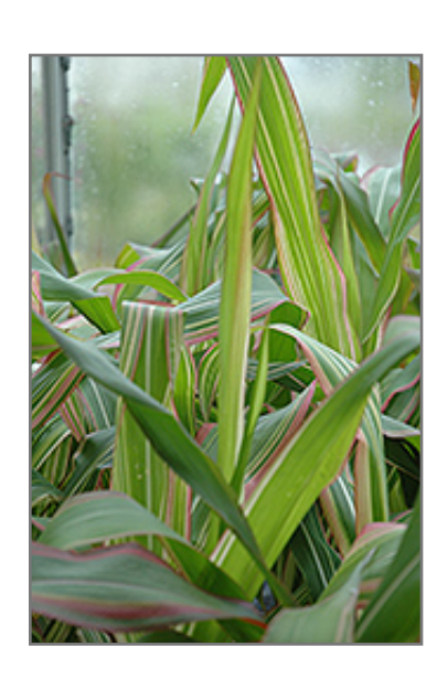
Field Of Dreams Ornamental Corn foliage

This plant does best in full sun to partial shade. It prefers to grow in average to moist conditions, and shouldn't be allowed to dry out. It is not particular as to soil type or pH. It is somewhat tolerant of urban pollution. This is a selection of a native North American species.